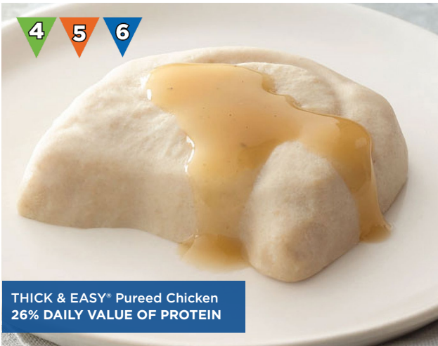
THICK & EASY® Pureed Chicken 26% DAILY VALUE OF PROTEIN

Ingredients: Dark Chicken Meat, Water, Pea Protein, Canola Oil, Brown Rice Protein, Contains 2% or less Chicken Stock (Contains Natural Flavor, Sea Salt), Modified Cornstarch, Cultured Dextrose (Cultured Dextrose, Maltodextrin), Salt, Konjac Gum.