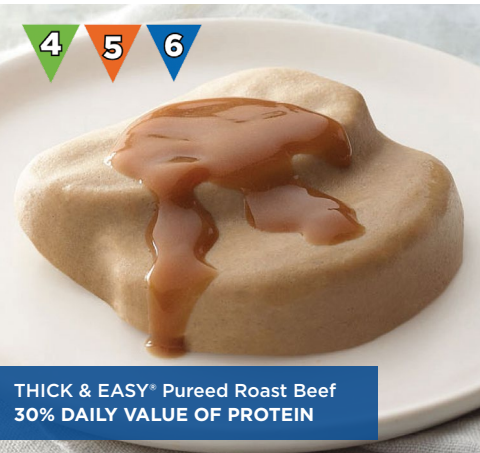
THICK & EASY® Pureed Roast Beef 30% DAILY VALUE OF PROTEIN

Does not contain any of the Big 9 allergens.