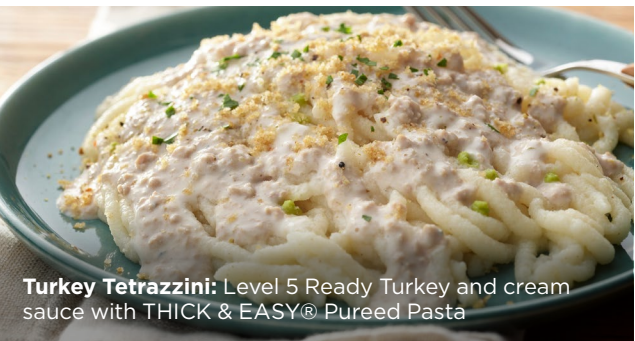
Turkey Tetrazzini: Level 5 Ready Turkey and cream sauce with THICK & EASY® Pureed Pasta