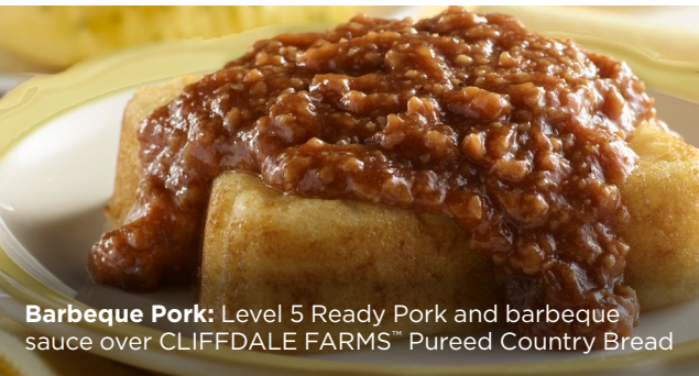
Barbeque Pork: Level 5 Ready Pork and barbeque sauce over CLIFFDALE FARMS™ Pureed Country Bread