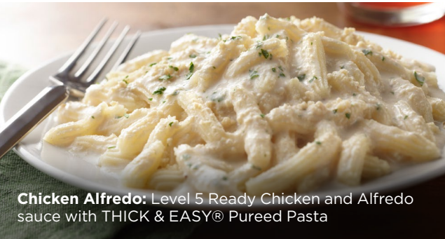
Chicken Alfredo: Level 5 Ready Chicken and Alfredo sauce with THICK & EASY® Pureed Pasta